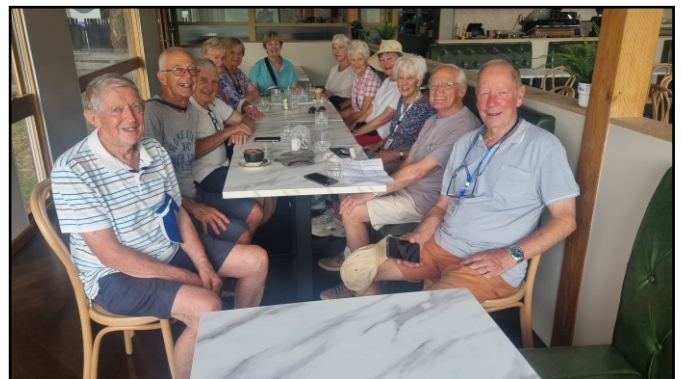
Our first coffee inside at the new T House café (after the usual Probus morning walk)