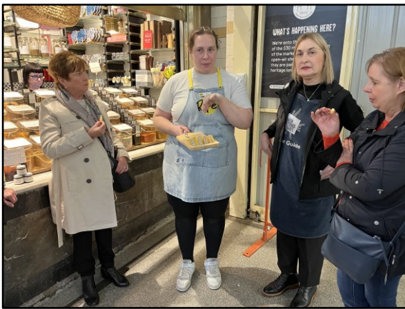
More and more goodies to taste.