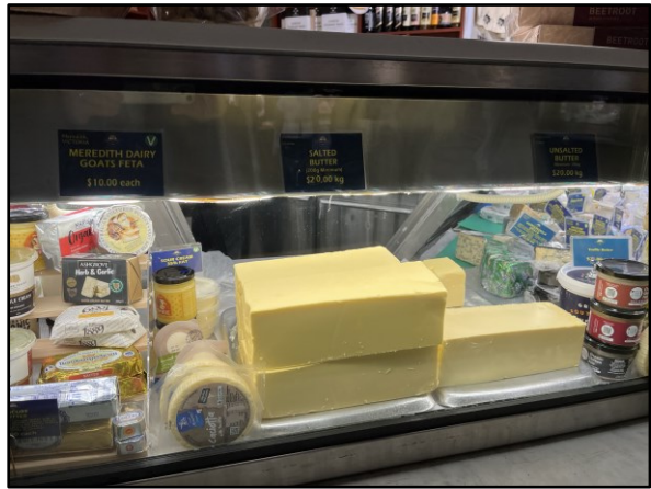
Cheese to die for.