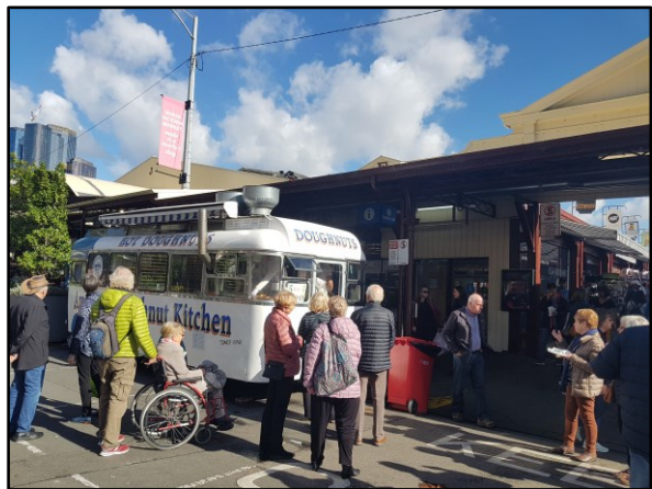
The Doughnuts for dessert. How did we eat lunch?