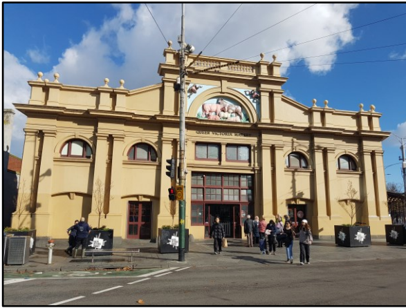
Victoria Market entrance.