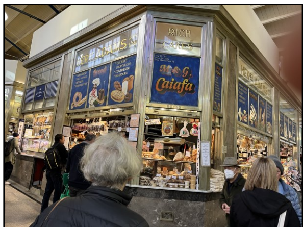
The delicatessen area.