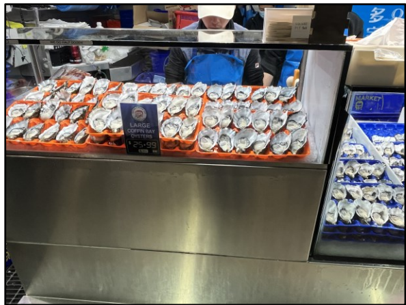
The Coffin Bay Oysters looked yummy.