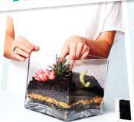
7 Dig holes, position the plants and fill in with soil, firming it down to remove any air pockets.