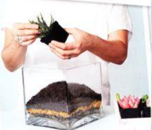
6 Remove the plants from the pots. Scrape excess soil from the rootballs and trim any roots longer than 50mm.