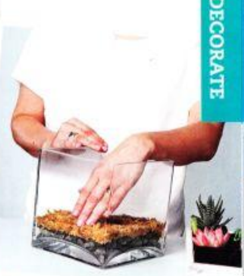
3 Press moistened sphagnum moss tightly around the inside edge to prevent any soil dropping through.