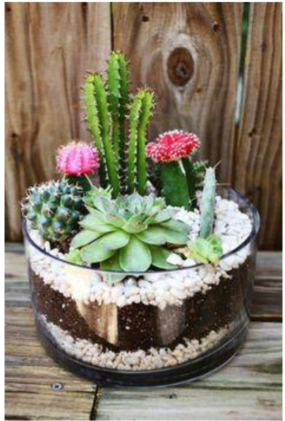
More ideas for Terrariums