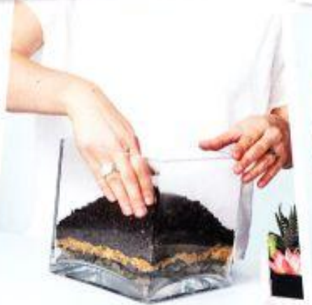
5 Add more soil in some areas to make a mound and create variations in height.