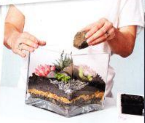
9 Finish the miniscap with feature rocks, decorative stones, pebbles, crystals or figurines. >