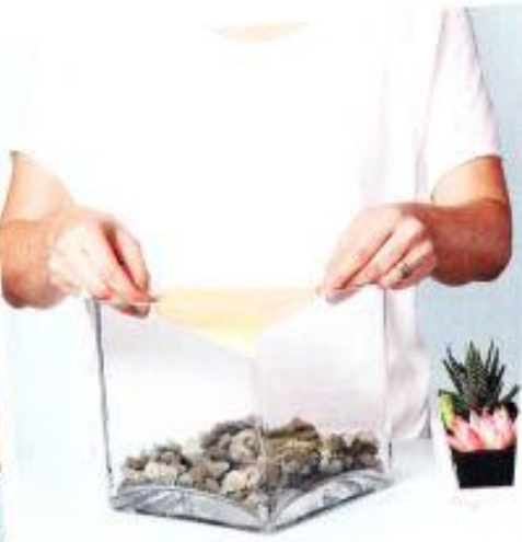
2 Cut a piece of butcher's paper a bit smaller than the container and position on the gravel or pebbles.