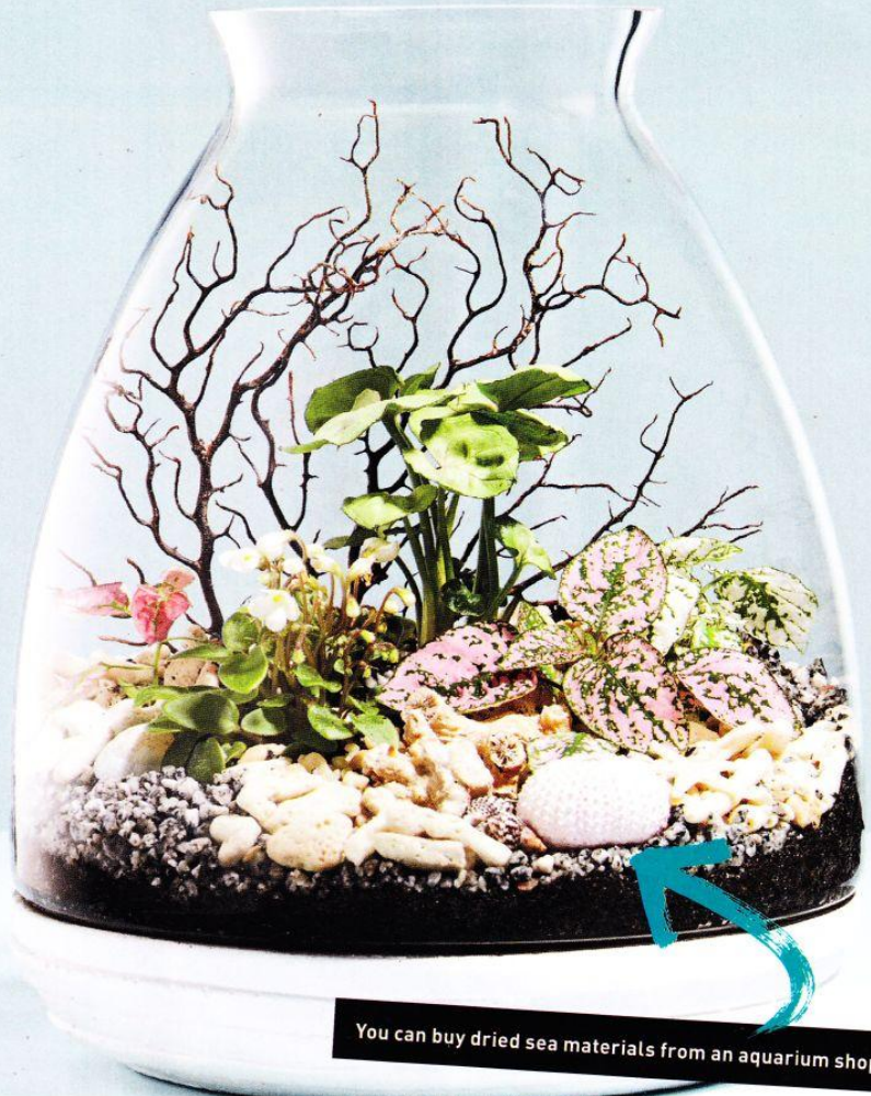
You can buy dried sea materials from an aquarium shop.

Add decorative pebbles and coral around the inside edge, then the shells, sea urchin and starfish. Water the plants well using a spray bottle.