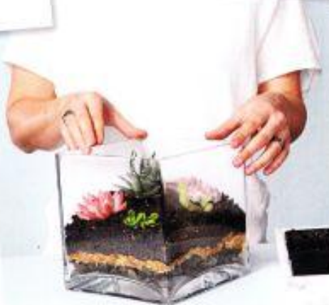
8 Put tall plants at the back and small at the front. Wash down the sides and water the plants with a spray bottle.