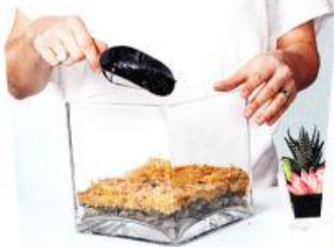
4 Sprinkle in 4 tablespoons of horticultural charcoal, then add a 50-70mm layer of soil.