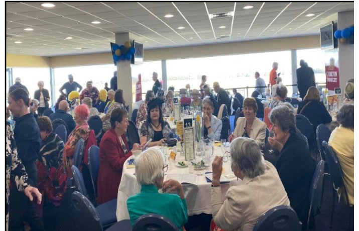
Enjoying the Day