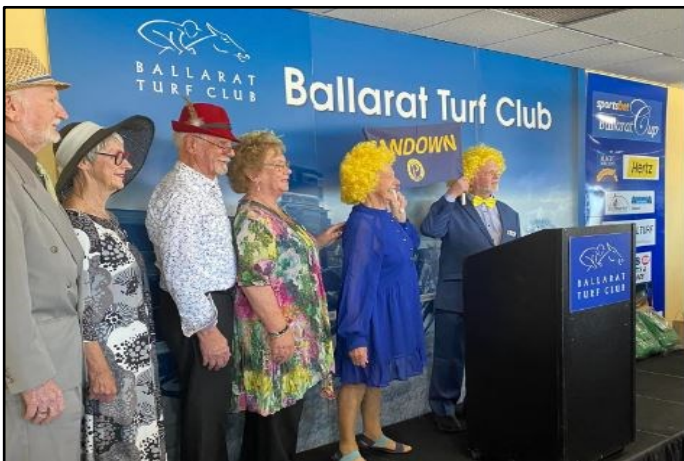
Presentations for Best Dressed

Weather for the day was pleasant & it was fine & sunny on our arrival at the Ballarat Turf Club