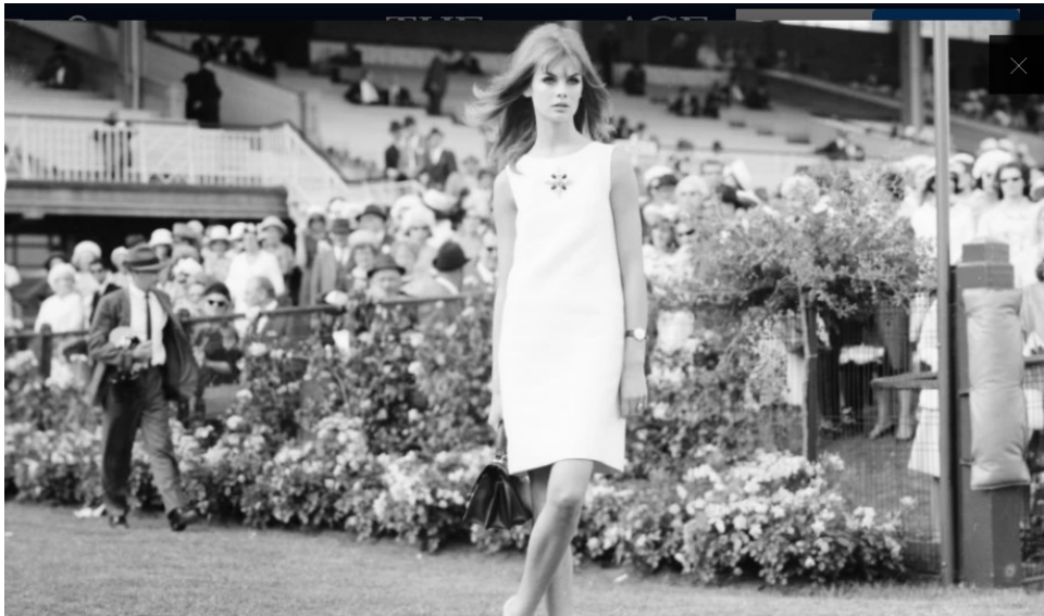
Jean Shrimpton on Derby Day in 1965. CLIVE MACKINNON

(Photos and Comments courtesy Ray Binks)