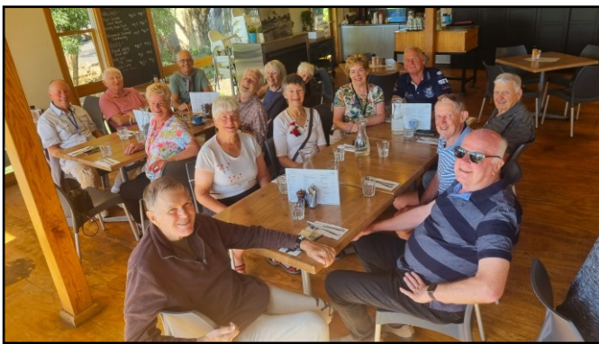
The whole group.