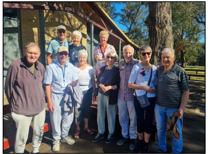
Some of the group before breakfast.