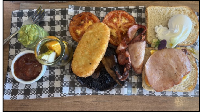
The big breakfast.