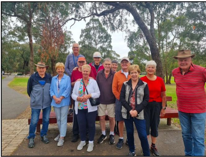
An earlier photo of the group taken 7/12/23.